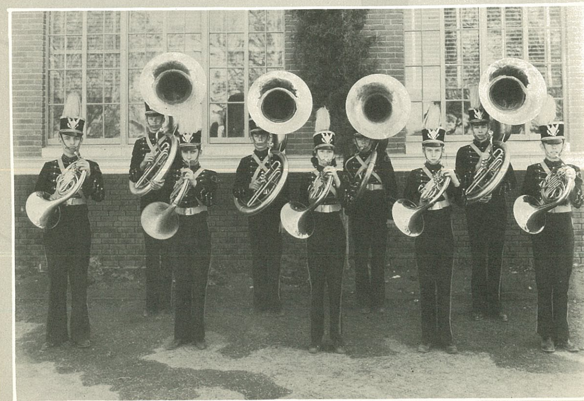
BASS AND FRENCH HORN SECTIONS